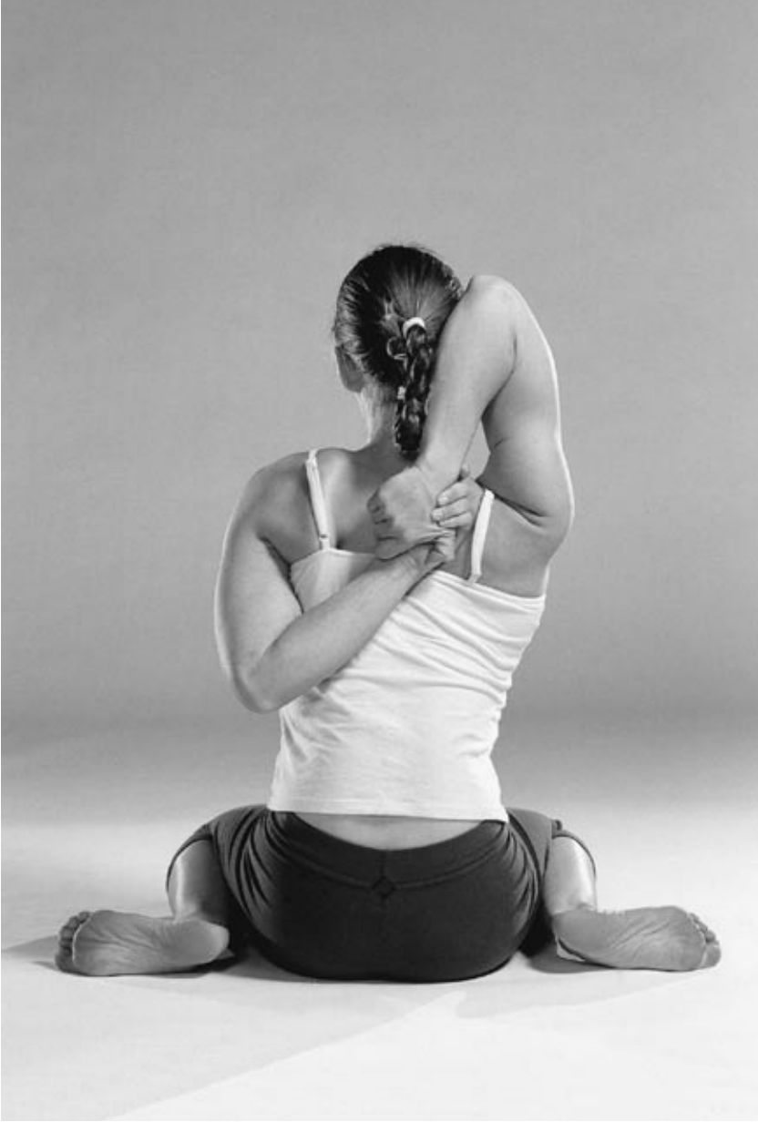
गोमुखासन – Gomukhasana